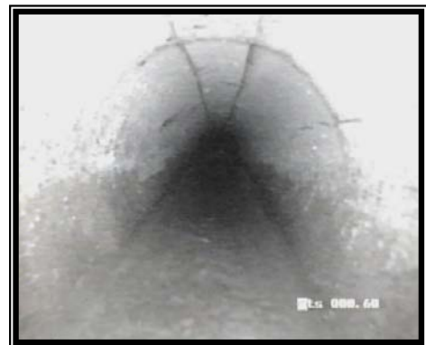
A NEWLY LINED 150MM CLAY PIPE