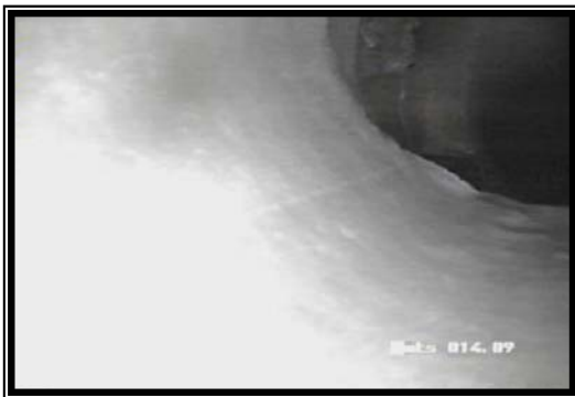
SINGLE ENTRY SHOT TO A BLIND CONNECTION TO THE MAIN 5M DEEP