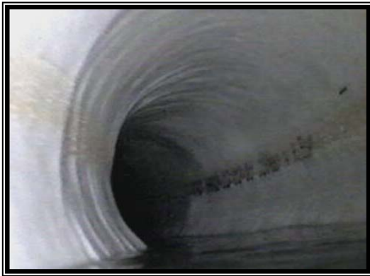
RECENTLY INSTALLED 4.5mm STRUCTURAL LINER NEGOTIATING A 60° BEND