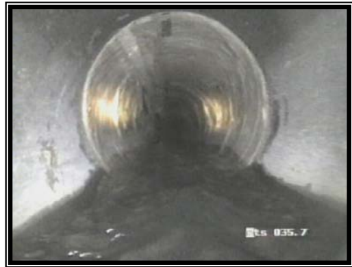
1M PATCH LINING OF A 300MM CONCRETE DRAIN